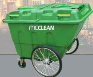
400L Pushcart Bin