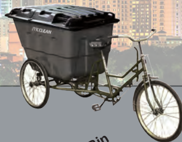
400L Tricycle Bin