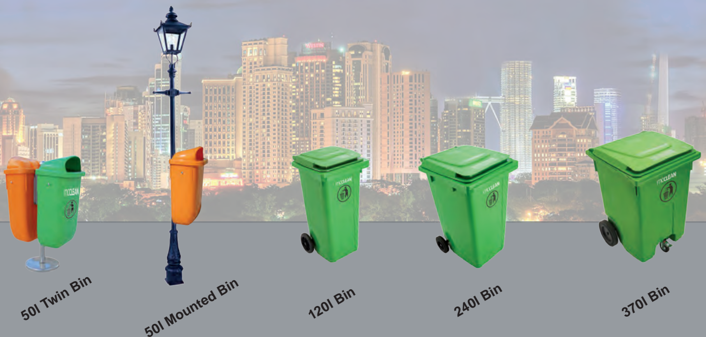
50l Twin Bin