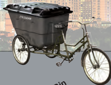
400L Tricycle Bin